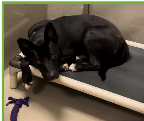
All our dogs have received new, elevated dog beds so they can rest easier in the shelter.