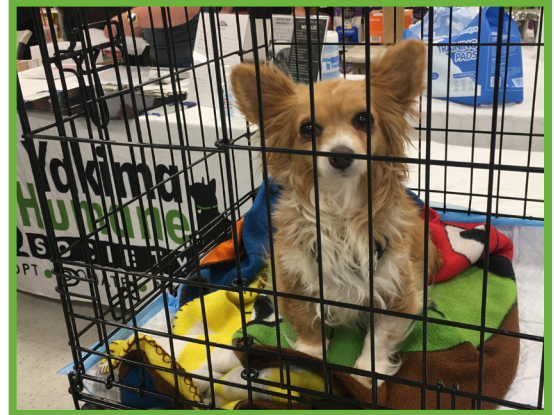
Community events increase exposure for our work and our animals.