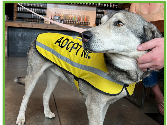
People shouldn't be the only ones who get to visit Yakima's amazing breweries!