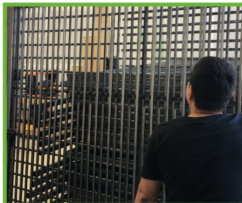
A new play yard is under construction and coming to YHS in August!